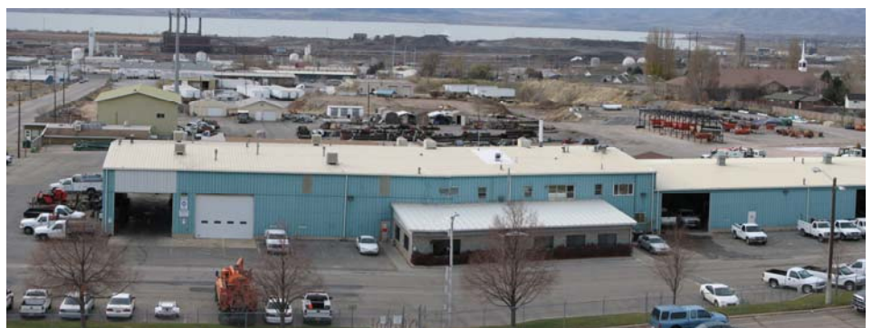
Old Public Works Complex